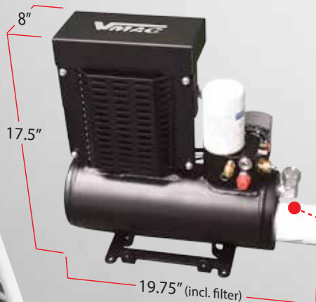
VMAC WHASP Tank

The LITE's simplified design means a quick install time to minimize downtime.