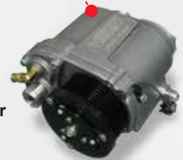
VMAC UNDERHOOD LITE Air Compressor 30CFM with 100% duty cycle, VMAC oil-injected rotary screw air compressor