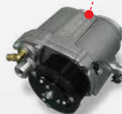
VMAC UNDERHOOD LITE Air Compressor 30CFM with 100% duty cycle, VMAC oil-injected rotary screw air compressor