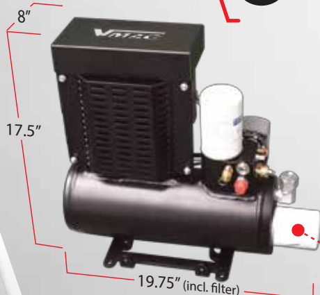
VMAC WHASP Tank

The LITE's simplified design means a quick install time to minimize downtime.