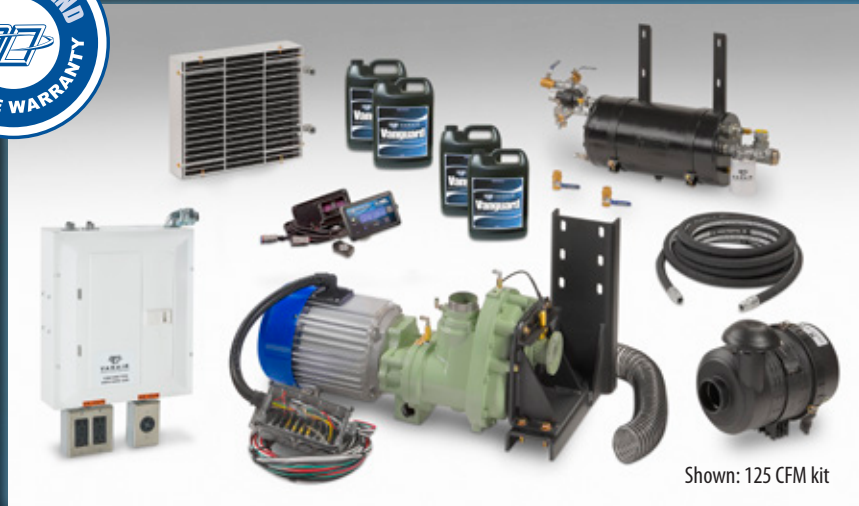
Shown: 125 CFM kit