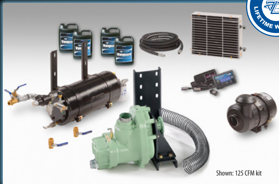
Shown: 125 CFM kit