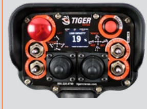
Standard wireless proportional crane and chassis control with digital crane load display.