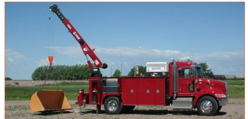
The 1069 Tiger Crane features 29 ft of hydraulic reach and 11,000 lbs of lifting capacity, all in a crane that can be mounted on a 25.5k GVW or larger chassis.