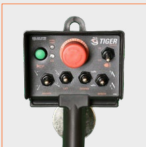
Optional remote with 25' tethered cord (no wireless functionality).