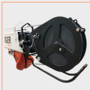
Hydraulic and manual boom extension with standard A2B.