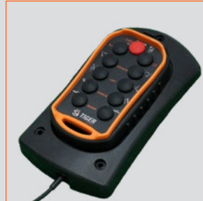
Optional wireless charging pad.