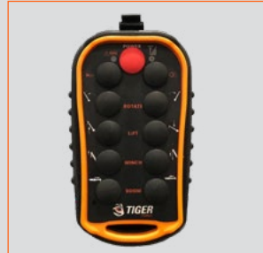
Standard wireless remote provides additional functionality and freedom of operator movement.