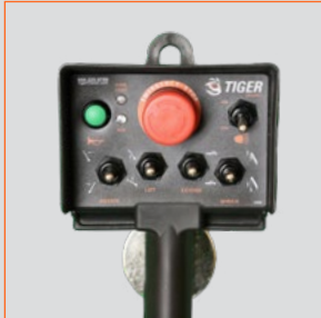
Optional remote with 25' tethered cord (no wireless functionality).