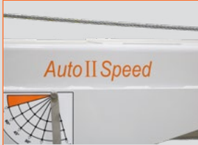
Auto II Speed automatically reduces the maximum working speed of all crane functions when a load is sensed.