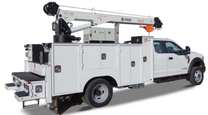
The 6542 is the most popular Tiger Crane model. Boasting a very strong 40,000 ft-lb rating and 6,500 lbs lift capacity, the 6542 is the crane for your medium duty service truck.