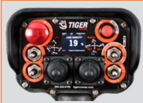
Standard wireless proportional crane and chassis control with digital crane load display.