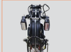
Boom tip light option adds work area lighting directly below hook. Dual LED lights with side-to-side adjustment.