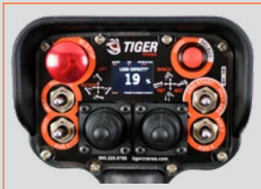
Standard wireless proportional crane and chassis control with digital crane load display.