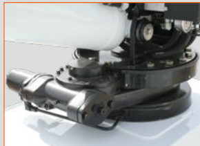
Fixed Rotation - The 7543 features a fixed base that allows it to work well with deck covers without the need for a riser.