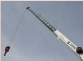
Exclusive sequenced two-stage hydraulic boom extensions provide a total of 30.5 ft of reach.