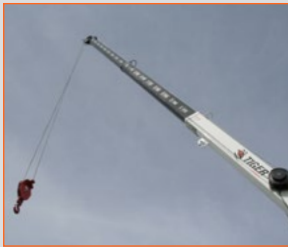
Exclusive sequenced two-stage hydraulic boom extensions provide a total of 29 ft of reach.