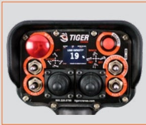
Standard wireless proportional crane and chassis control with digital crane load display.